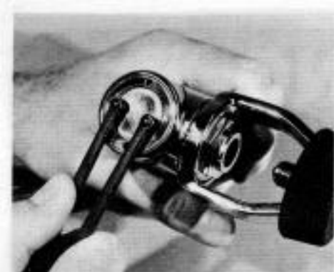
Easy external adjustment of first stage.

diver in need places the regulator in his mouth, the positioning is correct. Clever design.