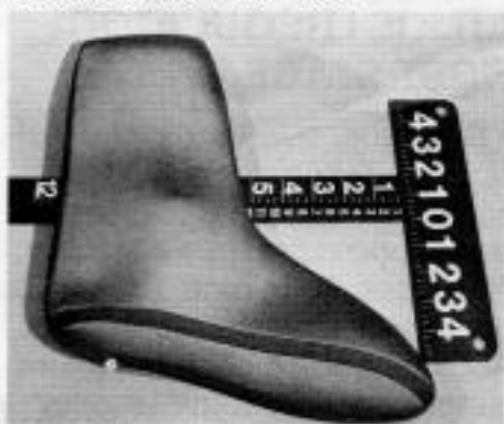
Bent ankle design.