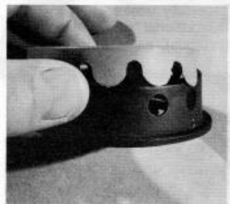
12-port, large-area exhaust valve ring.

With all the easy-repair features, how often does Submarex expect you to have problems? So rarely the Atmos comes with a limited lifetime warranty for the first owner. The Submarex warranty system is unique in the industry. Customer satisfaction is a total commitment by Submarex.