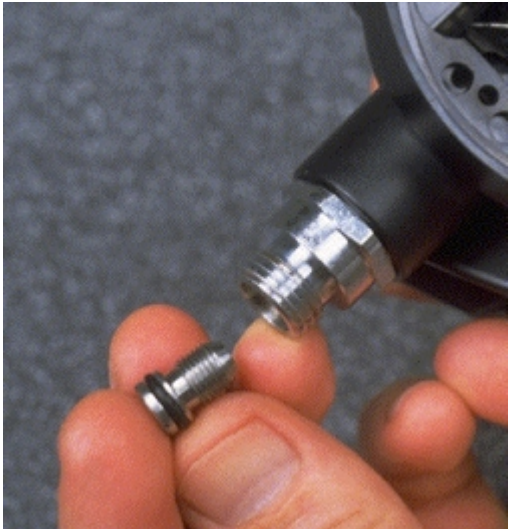
Fig. 10 Doc. 12-2224-r02 (2/12/03)