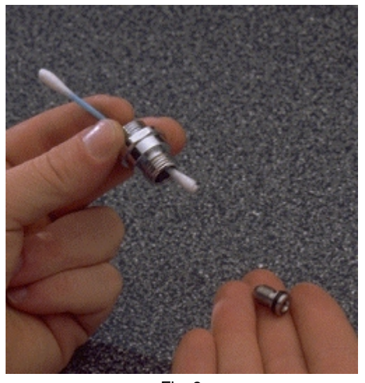
Fig. 3 Doc. 12-2224-r02 (2/12/03)