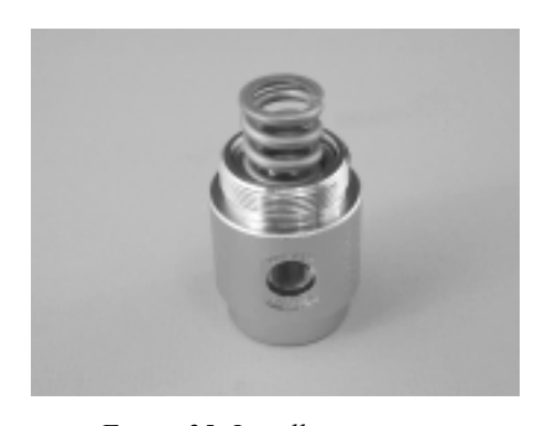
Figure 25. Install main spring

5. Install a new, lubricated O-ring (9) on the piston head. Liberally lubricate both sides of the piston head. Press the piston head all the way into the piston chamber (see figure 26).