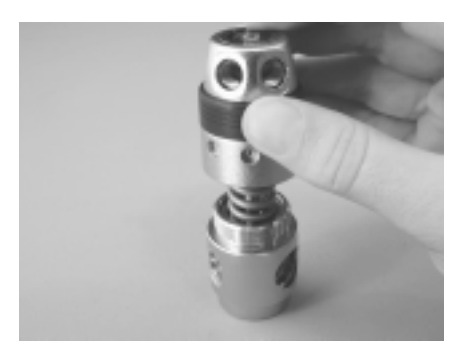
Figure 28. Installing piston assembly

7. Install a vise mounting tool into one of the HP ports and mount the first stage in a vise. Hook the side spanner wrench into one of the holes on the piston chamber and tight the chamber until it stops (metal meets metal) as shown in figure 29.