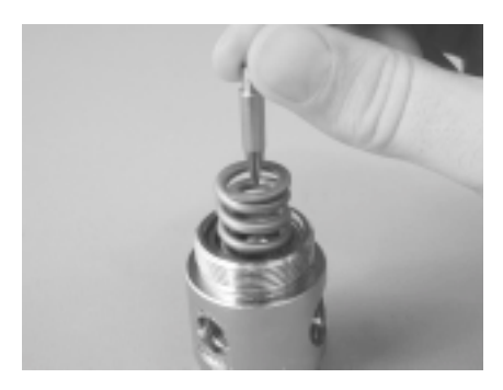
Figure 27. Piston installation guide

6. Carefully insert the piston installation guide, tapered tip first, into the body as shown in figure 27. Pass the piston shaft through the center of the spring into the piston installation guide as shown in figure 28. Compress the spring and thread the piston chamber onto the body. Remove the installation guide.