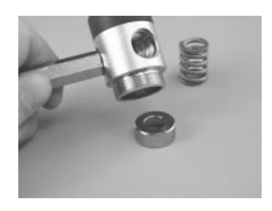
Figure 5. Remove spring support

Lift out the main spring (11). Remove the first stage body from the vise (but leave the mounting tool in place). Tap the first stage against the workbench until the spring support (12) falls out (see figure 5).