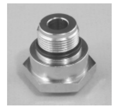
Figure 37. Install inlet fitting O-ring

12. Insert the filter (30), conical end first, into the face of the inlet fitting (see figure 38). Compress the filter retainer (31) and insert it into the inlet fitting. Use a small dowel to work the retainer into place (see figure 39). Inspect the retainer to make sure it is captured all the way around the perimeter.