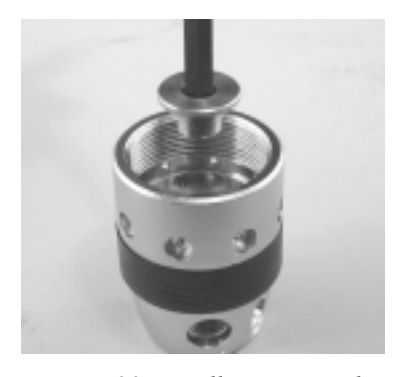
Figure 20. Install retainer with 6mm hex wrench

Screw a vise mounting tool into one of the LP ports and secure the swivel into a vise. Attach a 6mm hex key to a torque wrench and tighten the retaining nut to 20 foot-pounds (see figure 21). Remove the vise mounting tool. Set the assembly aside.