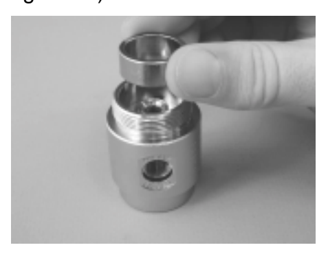
Figure 24. Install spring support

4. Install the spring support (12), open side facing out, into the first stage body (see figure 24). Place the main spring (11) into spring support (see figure 25).