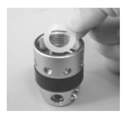
Figure 19. Install retainer washer