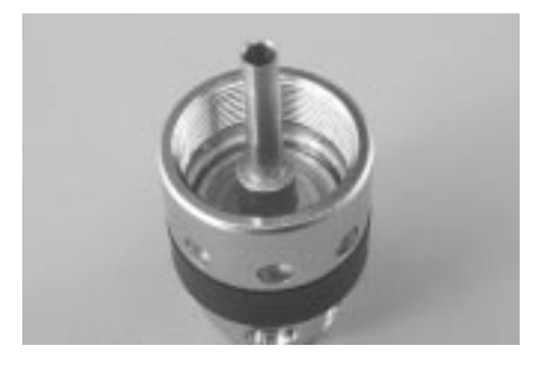
Figure 26. Press piston into piston chamber

5. Install a new, lubricated O-ring (9) on the piston head. Liberally lubricate both sides of the piston head. Press the piston head all the way into the piston chamber (see figure 26).