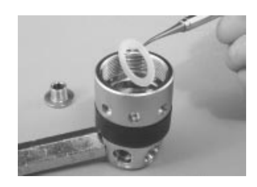
Figure 15. Remove swivel washer