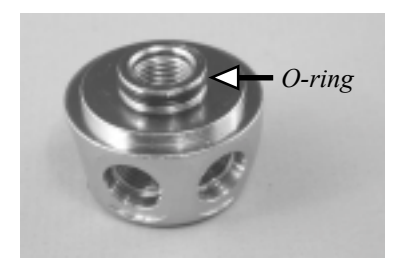
Figure 17. Install new O-ring onto swivel

1. Install a new, lubricated O-ring (4) onto the swivel (1) as shown in figure 17. Place the spacer ring (5) onto the tapered side of the piston chamber (6) as shown in figure 18. Press the swivel (1) into the piston chamber. Place the washer (7) into the bottom of the piston chamber (see figure 19). Place swivel retaining nut (8) onto a 6mm hex wrench and thread the retaining nut into the swivel (see figure 20).