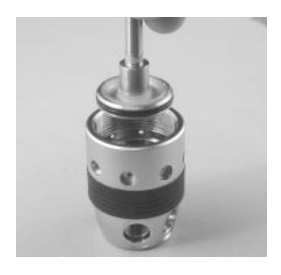
Figure 4. Remove piston from chamber

8. Carefully remove the piston (10) from the piston chamber (see figure 4). Take special care not to drop the piston as it may damage the end that seals against the HP seat. Remove the O-ring (9) located on the piston head.