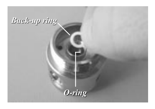
Figure 22. Install shaft O-ring, followed by back-up ring

3. Install a new, lubricated O-ring (15) into the hole for the piston shaft, just below the threads. Place the backup ring (14) on top of the O-ring (see figure 22). Use a small dowel to gently press these two parts so that they lay flat. Using a thin, wide-bladed tool (a common butter knife works well), thread the retaining ring (13) into the body until it stops (see figure 23).