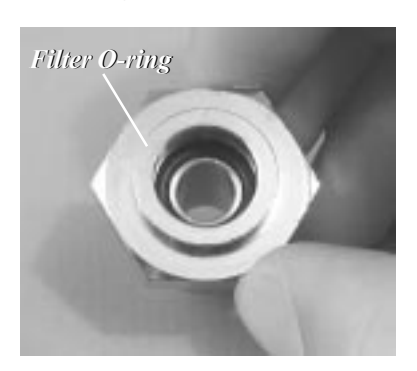
Figure 36. Install filter O-ring

11. Install a new O-ring (29) into the inlet fitting. Using your finger, press the O-ring into the groove located inside the inlet fitting and make sure it is seated evenly (see figure 36). Install a new, lubricated O-ring (27) onto the inlet fitting, just above the threads (see figure 37).