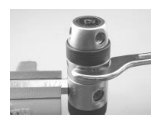
Figure 3. Remove piston chamber

Using a side spanner wrench, remove the piston chamber by hooking the wrench into one of the holes and turning the chamber counterclockwise (see figure 3).