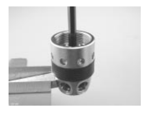
Figure 14. Remove swivel retainer

17. Thread a 3/8" inch vise mounting tool into one of the LP swivel ports. Mount the swivel into a vise with piston chamber facing upward. Using an 6mm hex wrench, remove the swivel retaining nut (8) as shown in figure 14. Using an O-ring tool, lift out the washer (7) as shown in figure 15.