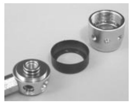
Figure 16. Separate swivel from piston chamber and remove spacer

18. Separate the swivel (1) from the piston chamber (6) and remove the spacer ring (5) as shown in figure 16. Remove the swivel O-ring (4).