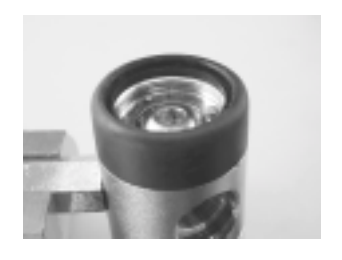
Figure 34. Install rubber cap