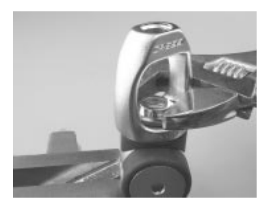
Figure 1. Remove the inlet fitting

5. Mount the first stage into a vise as described in the caution above. Using a large adjustable wrench or 1-inch crows-foot, unscrew the inlet fitting (28) as shown in figure 1. Separate the inlet fitting from the yoke (25) and spacer (24). Leave the first stage mounted in the vise.